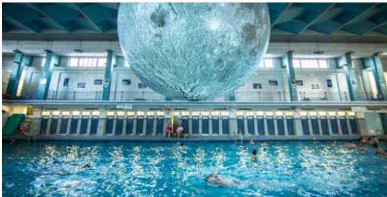
#Rennes #1h25fromParis #creative #interactive #cultural #stopmotion #videogame #digital