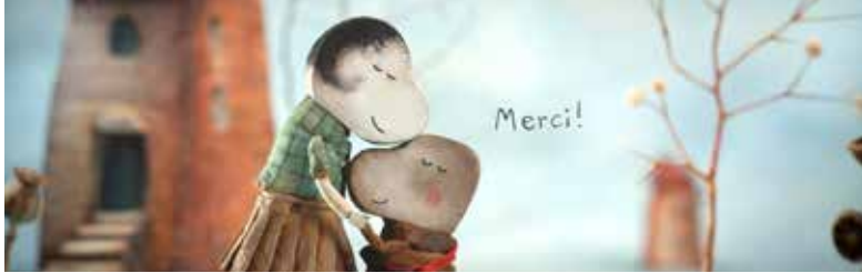
#Rennes #1h25fromParis #creative #interactive #cultural #stopmotion #videogame #digital